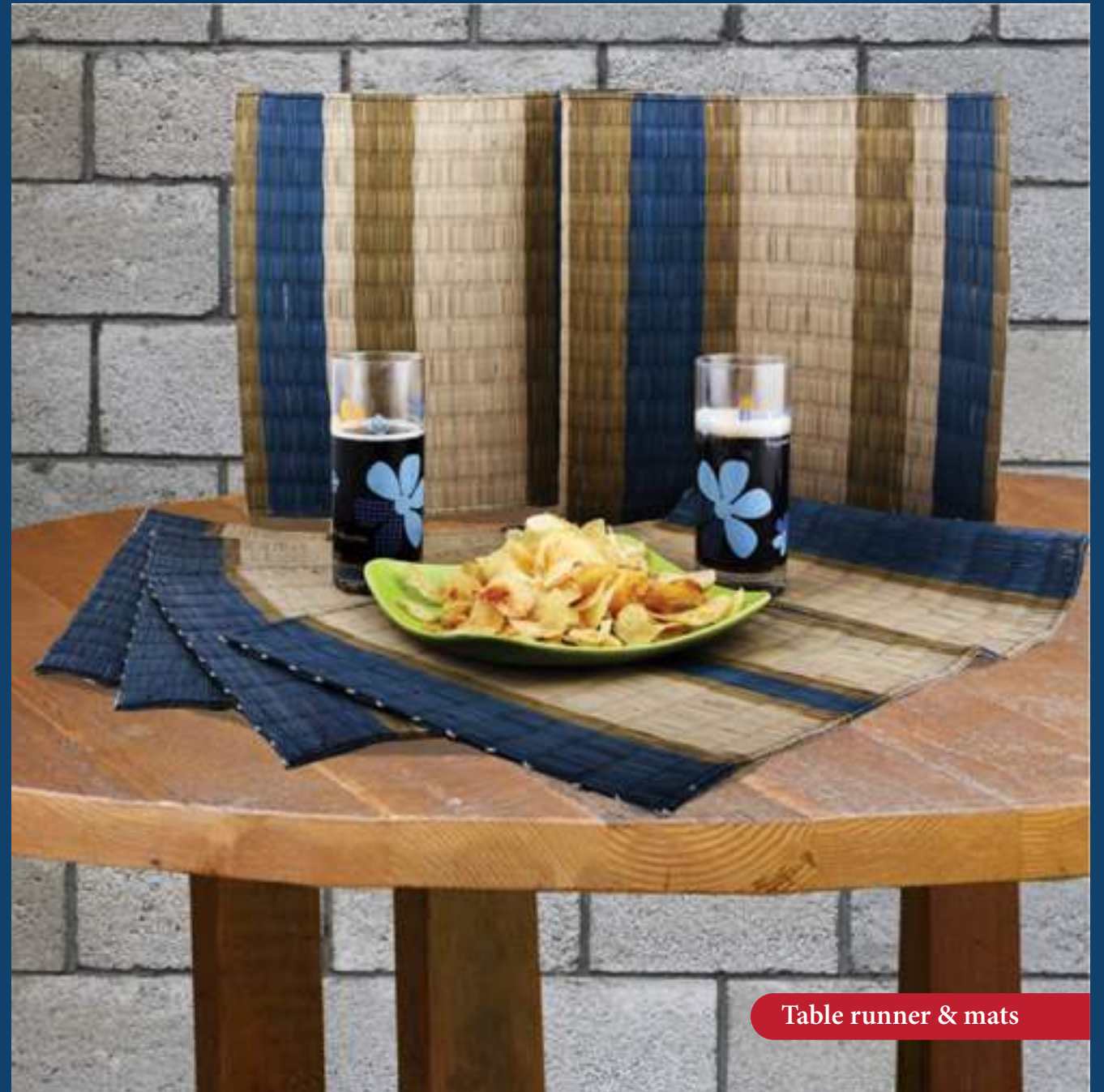
Table runner & mats