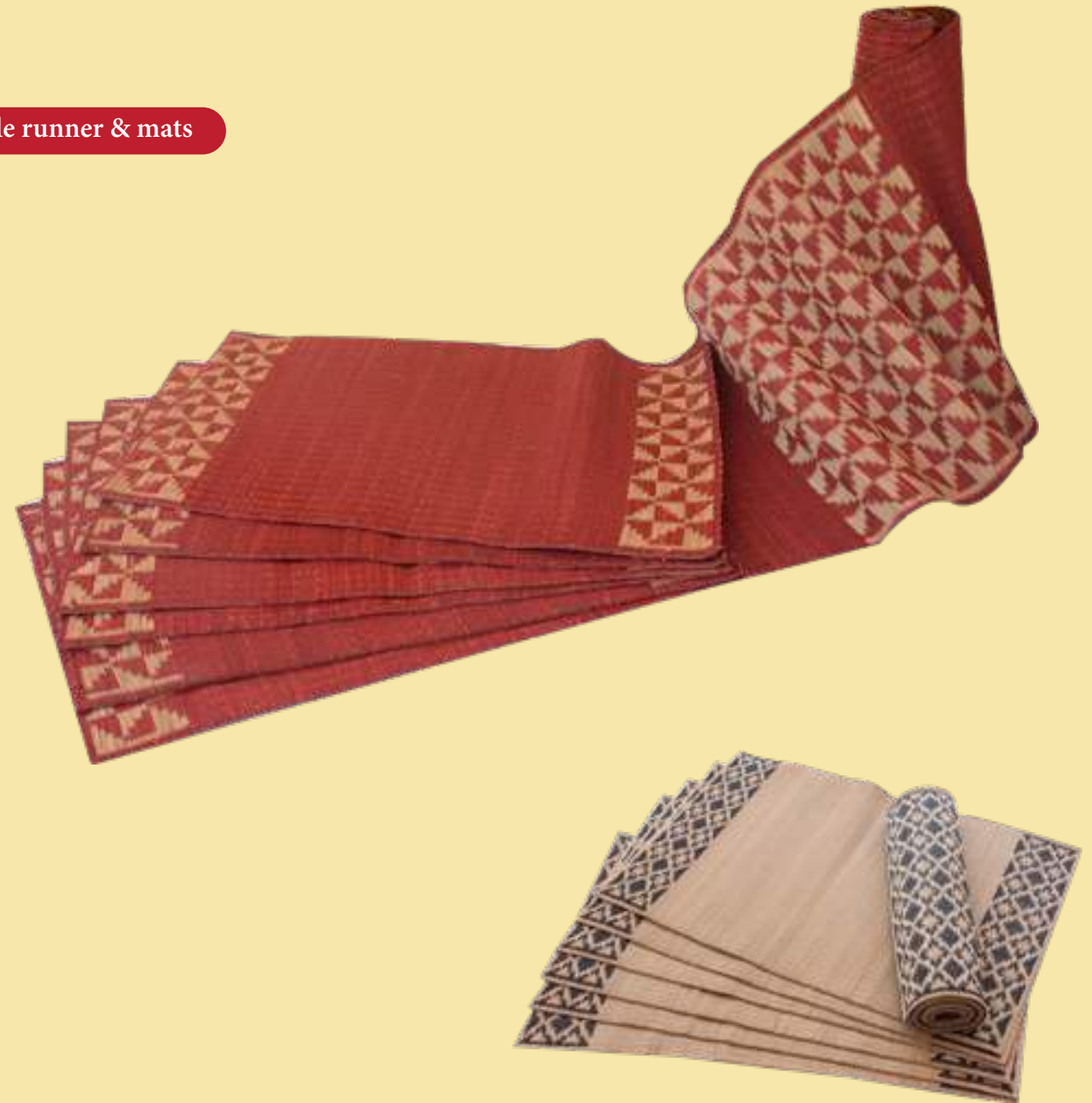
Table runner & mats