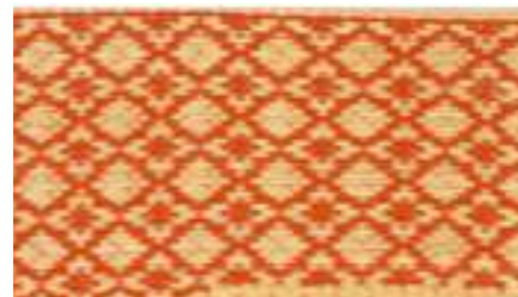
Honey comb pattern