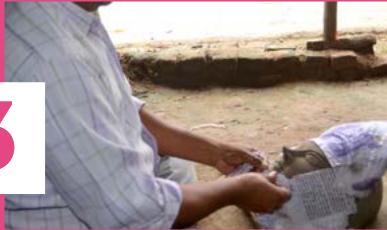
Lining with paper