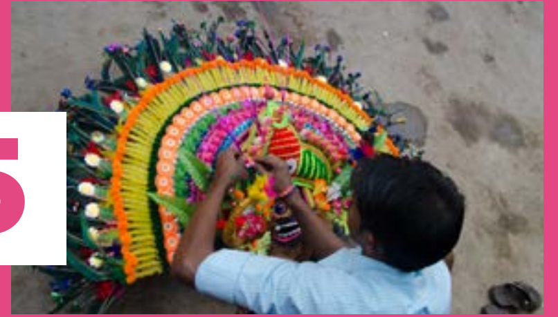
Adornment and finishing