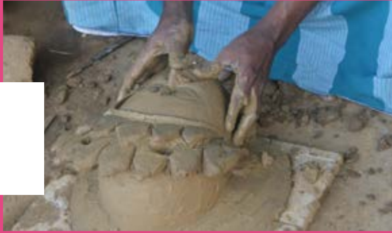
Preparation of clay mould