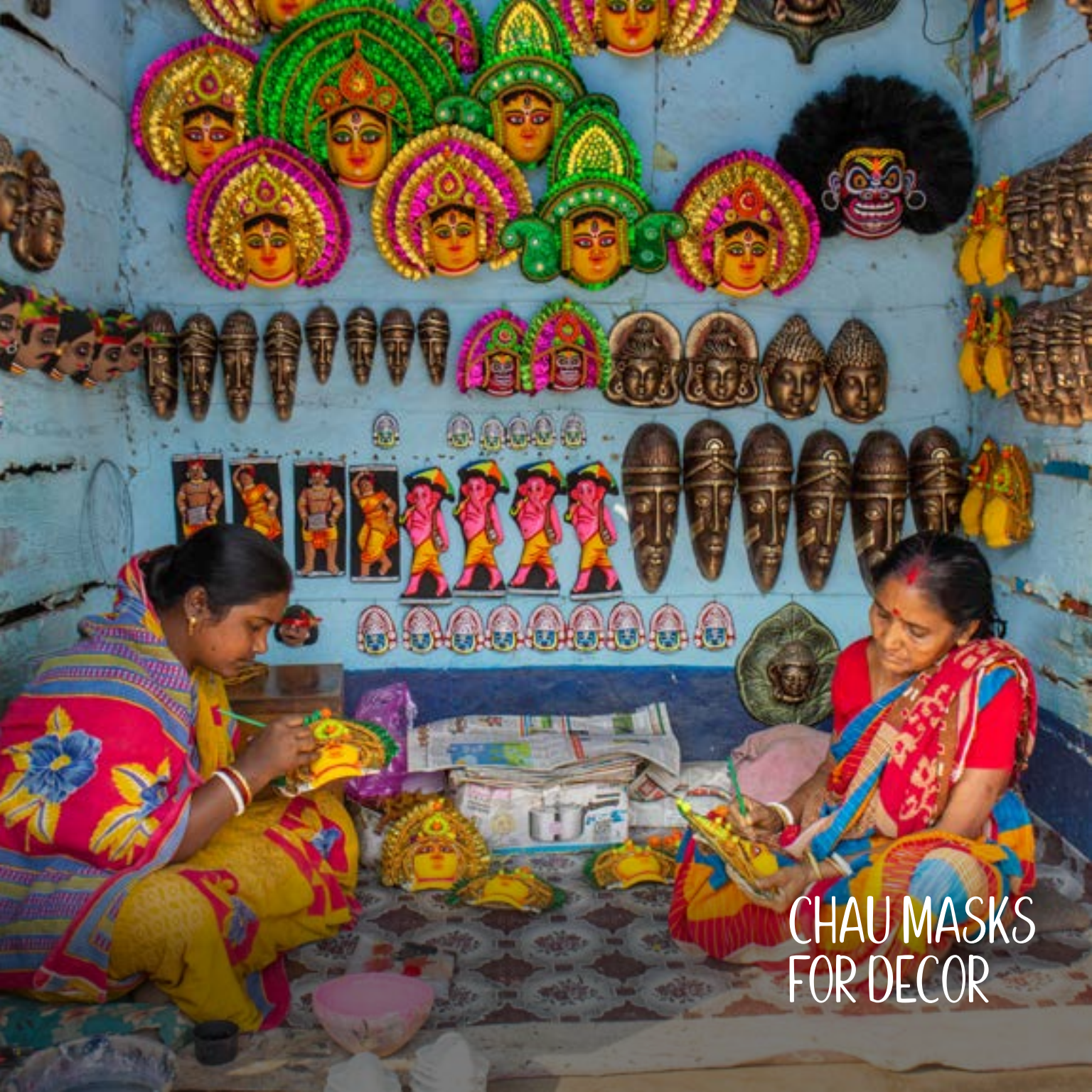
CHAU MASKS FOR DECOR